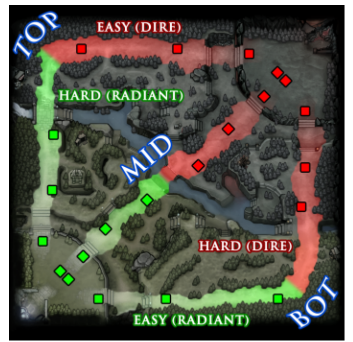
Figure 1. The DOTA 2 worldmap.

Figure 1, below, shows the worldmap of the DOTA 2 game. Several things are important to note. Heroes of the Radiant (green) start bottomleft and work towards top-right, while the Dire (red) proceed as the mirror opposite. There are three paths through the forest, called lanes, which are designated as "top," "mid" or middle, and "bot" or bottom. These lanes sport guard towers that engage enemies and support allies that come within range; boxes indicate their locations on the map, with color indicating ownership of the towers. To achieve victory, a team must destroy the guard towers in at least one entire lane, moving in towards the enemy's base and destroying the towers in sequential order. Once these towers have been destroyed, the team can attack the enemy's Ancient, the primary structure at hub of each base in the extreme upper-right and lower-left corners, with the intent of destroying it. Once the enemy Ancient is eliminated, the game is finished.