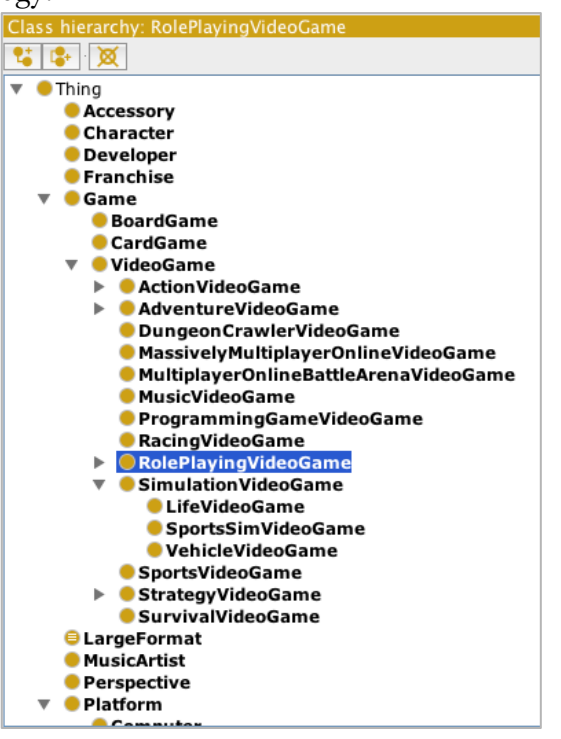
Figure 2. Detail of the Video Game Ontology

terminology associated with their creation and play. However, when the .owl file is loaded (see Figure 2, below) it becomes apparent that it does not follow BFO v1.1 at all and introduces no real hierarchy that could later be expanded or modified. This is rather problematic and indicates that it would not be a good candidate for integration into this ontology.